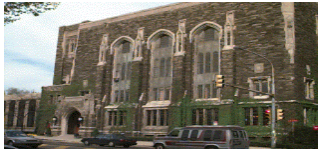
Mitten Hall, where the Diamond Club is located, Temple University