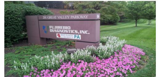
Fujirebio Diagnostics, Inc. in Malvern, PA

Diamond Club was named in remembrance of the "Acres of Diamond" speech by Russell H. Conwell, the founder of Temple University and the theme of this speech lies at the heart of its mission. It recounts a story Conwell heard from a guide when he was travelling up the River Tigris in present day Baghdad in 1872. The tale refers to a person who leaves his home in the hope that he will find his fortune in foreign lands. After much wandering, he returns home, heartbroken and penniless. He soon dies, and being so poor, the locals decide to bury him in back yard of his house. As they begin digging his grave, they start to uncover diamonds, not just a handful but by the bucket load. Little did the man know that the fortune he was looking for was in his own back garden!