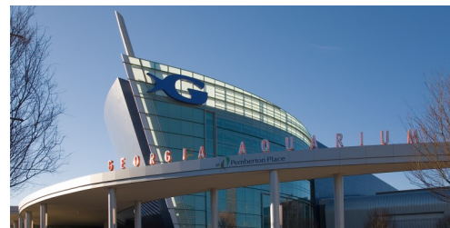
Georgia Aquarium - Social Event for the Philadelphia Section AACC

freezing ice, hitting Philadelphia and the adjoining states, all flights coming into Philadelphia Airport were cancelled. Unfortunately, we could not re-schedule that talk for this year, but we hope to be able to invite him again in the New Year.