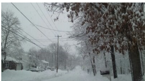
Snowing in Spring March 2nd 2015—the day the meeting was cancelled.