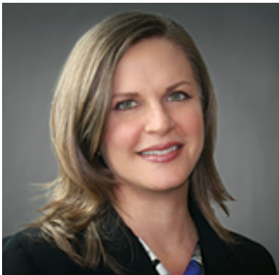
DR. CARMEN WILEY

Immunoassays are the workhorses of clinical laboratories. Using antibodies for diagnostic measurements provides high specificity and sensitivity. Despite all the successful uses of immunoassays, there are still problems with interferences. In this talk I review how the common immunoassay formats work. I cover the double antibody sandwich assays, competitive inhibition assays, and delayed capture assays. I then review how the different types of interference mechanisms cause falsely elevated and suppressed results for each assay format (i.e. steric hindrance, bridging, etc.). Finally, I review current strategies to troubleshoot interference.