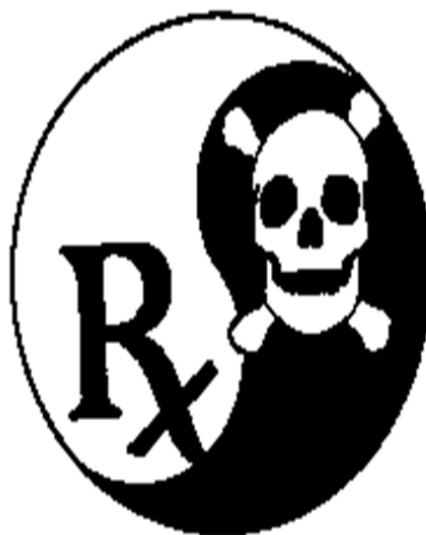
Logo for Therapeutic and Toxin Newsletter

The coupling of cytotoxic agents to monoclonal antibodies is a recent novel approach in pharmaceutical development and an alternative to therapy antitumor antibodies alone 10 . These antibody drug conjugates (ADCs) combine the targeting ability of antitumor antibodies with the potent cell killing activity of small molecule via a biodegradable linker, and have become a major focus of targeted cancer medicine. ADCs are expected to offer an advantage over traditional chemotherapy because by delivering the cytotoxic agent directly to the cancer cells, normal tissue exposure is minimized, leading to potentially fewer side effects and a more favorable toxicity profile 11,12 . Currently, other conjugates approved