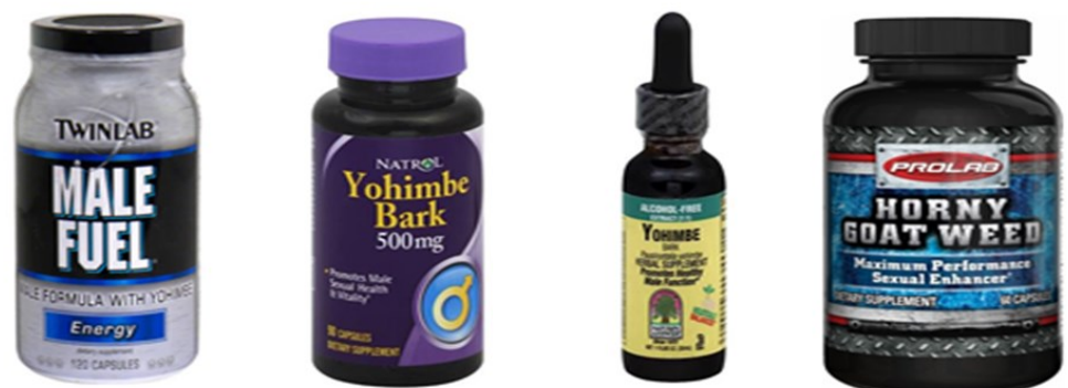
Figure 1. Some commercially available YH extract products.

"Common symptoms reported with YH overdose include anxiety, drowsiness, disorientation, tremors and seizures."