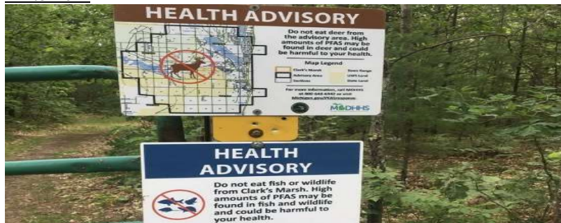
Figure 3. Health advisory signs posted near Wurtsmith Air Force Base to not eat local wildlife.

Conclusion: Though the production of the PFAS forever chemicals is phasing out in the U.S., there is great concern over past exposures. Recent research indicates that most Americans have PFAS present in their blood, and that it is commonly found in drinking water. It is vital that this publicly driven research continues. On a positive note, NHANES biomonitoring data indicate decreased levels of PFOA and PFOS from 1999 to 2018. The heightened awareness about the harmful effects of PFAS will hopefully ensure proper funding is made available for those adversely impacted as well as environmental remediation of major contamination sites. Those seeking to learn more about PFAS are encouraged to visit the EPA online site.