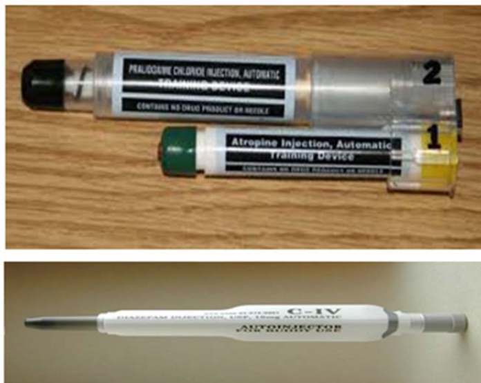
Figure 2. From top to bottom, pralidoxime & atropine autoinjectors, diazepam autoinjector. Chemical structures are presented on the right.